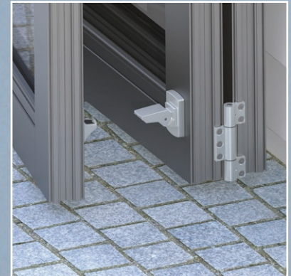
Bifold mount with short door stop